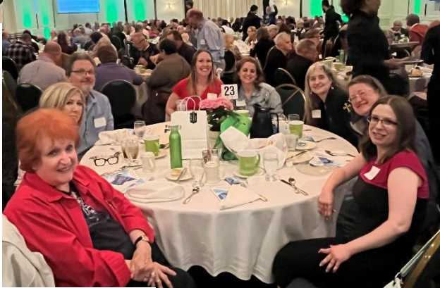
Pictured middle bottom: Members and friends of the Life Team at St. Luke in Clinton Twp.