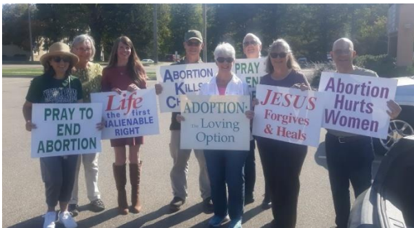
Pictured left: A group from Our Savior Lutheran Church in Lansing and friends joined in the Life Chain in October.