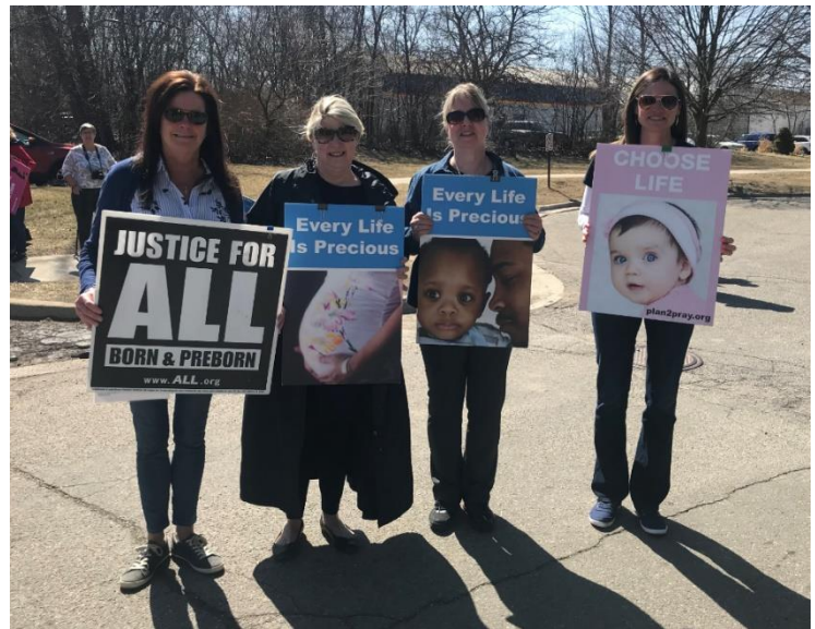
Our Savior Hartland at Jericho March, Ann Arbor, Sunday March 21