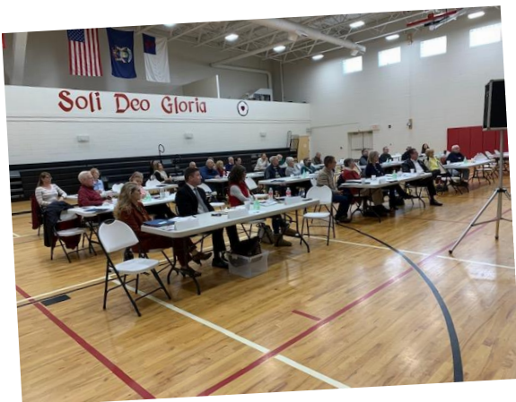
Our Savior Participants