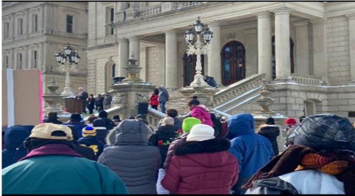
The crowd in front of the Capitol