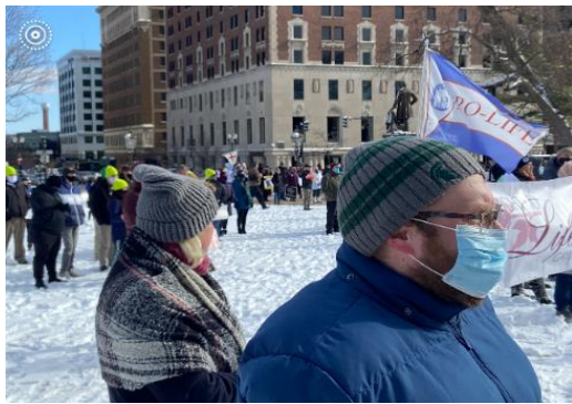
Attendees included St Paul Lutheran Church Fowler and Our Savior Lutheran Churches from Grand Rapids and Hartland