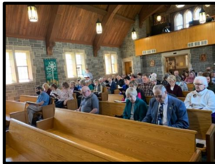
Approximately 75 attendees at the Summit