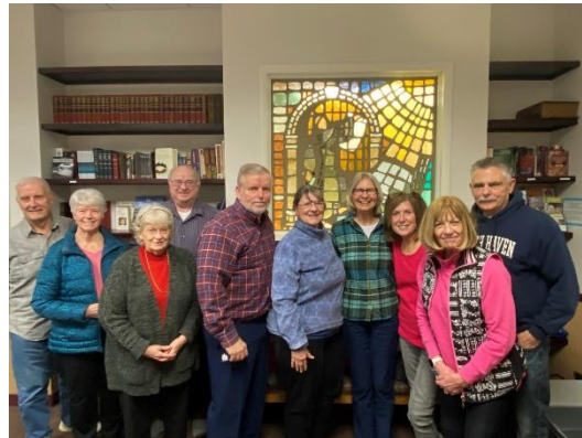
(Some members of the newly-created Life Team at Our Savior Lutheran Church and School in Lansing and part of their Life Sunday display)

We'd love to highlight your Life Team! Submit your article and/or photos and information to schaidtl@gmail.com